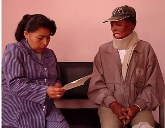
Luz with Fidel